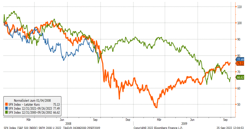
S&P 500 Index in comparison: 2001, 2008 and 2022

In the course of the week, the high level of fear turned into a touch of panic. At times, share prices fell significantly. Sentiment remains very weak. The market has now reached an interesting crossroads: do we continue to follow the 2008 path, which so far has also coincided relatively well with 2001? Or is the market changing lanes and following the 2001 path? The difference between 2001 and 2008 could hardly be greater as of now.